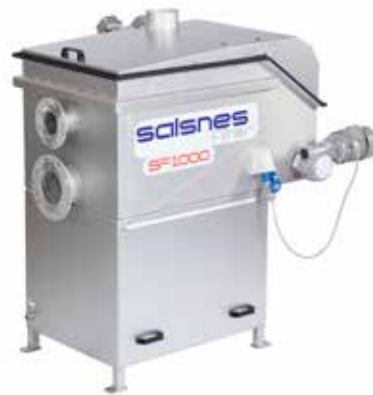
Figure 3. The Salsnes Filter SF1000 Rotating-Belt Filtration System.