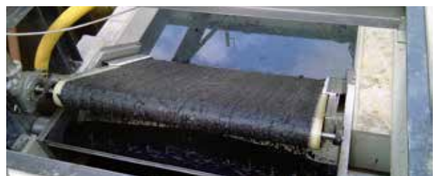
One of four SFK Salsnes Filters installed in a concrete channel.

Treated Flow: 10 - 60 m 3 /h (44 - 260 gpm) TSS Removal: 30 - 80% TSS Influent Average: 4000 mg/l