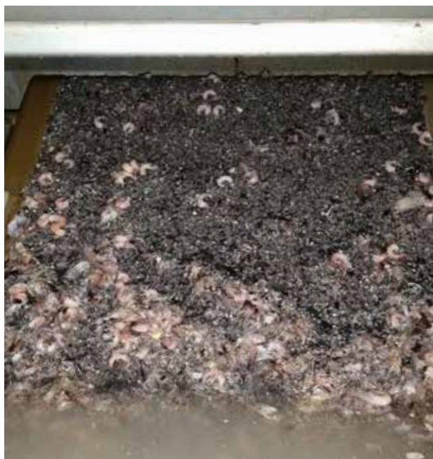
Separated solids build up on the filtermesh and then move onto the sludge thickening and dewatering processes integrated within the system.

Flow Rate: 20 m 3 /h (88 gpm) TSS Removal: 30 – 80% COD Removal: 15 - 40% TSS Influent Average: 1400 mg/l COD Influent Average: 2000 mg/l