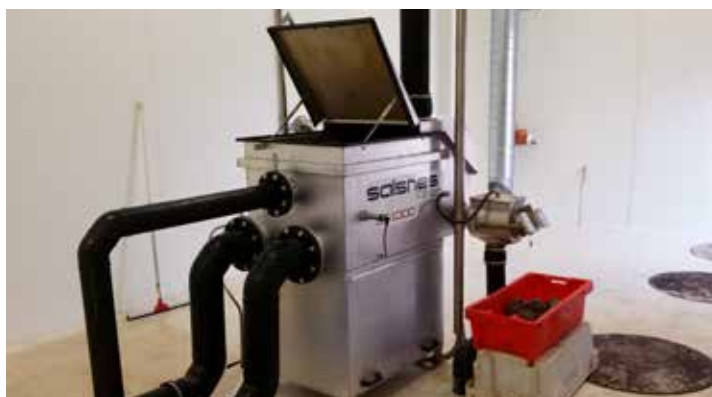
The SF1000 Salsnes Filter installed at the shrimp processing facility

One SF1000 Salsnes Filter with a 350 micron filtermesh was installed to remove 30 – 80% TSS and 15 – 40% COD from the wastewater to meet discharge requirements.