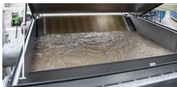
Wastewater enters the inlet and meets the filtermesh where solids separation takes place.