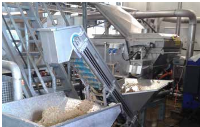
One SF4000 Salsnes Filter is installed to treat 100 m 3 /h (0.6 MGD) of wastewater.

Treated Flow: 100 m 3 /h (0.6 MGD) TSS Removal: 60 – 80% TSS Influent Average: 2100 mg/L