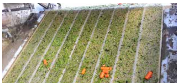
Particles are separated from the wastewater on the rotating filtermesh.

Flow Rate: 140 m 3 /h (0.9 MGD) TSS Removal: 60 – 80% COD Removal: 15 - 40% TSS Influent Average: 2000 mg/L COD Influent Average: 3500 mg/l