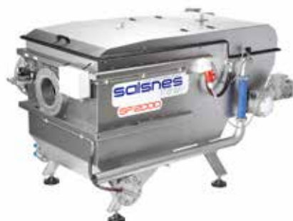
SF2000 SF4000 SF6000