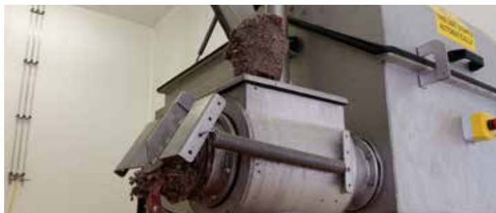
The Salsnes Filter system contains an integrated sludge dewatering unit.