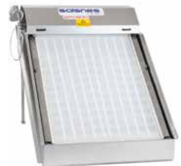
SFK200 SFK400 SFK600

Maximum Hydraulic Flow Up to 54 m 3 /h (0.3 MGD)