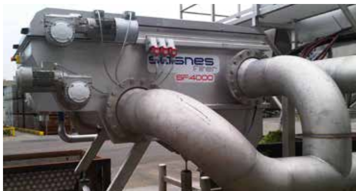
The SF4000 Salsnes Filter installed at the facility.