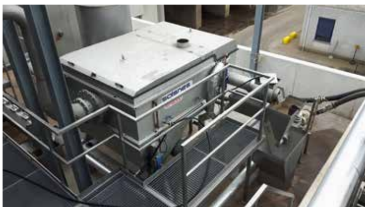
One SF6000 Salsnes Filter