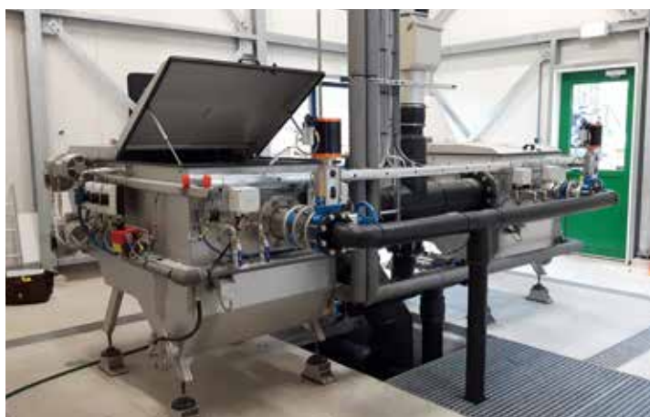
Two SF2000 Salsnes Filters

Incoming wastewater meets the filtermesh and glass fiber particles are separated.