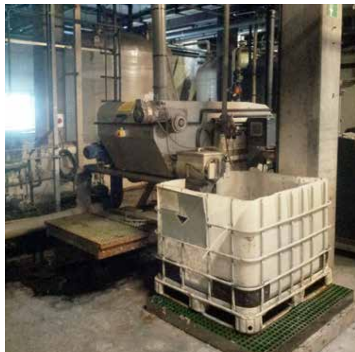
The SF2000 Salsnes Filter installed at the tannery.