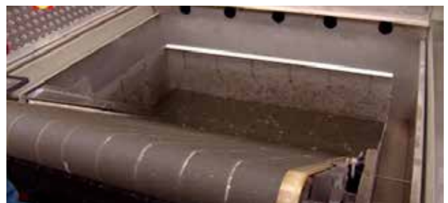
Filters are installed in channels and have integrated dewatering.