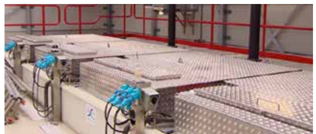
Four of the eight SFK600 Salsnes Filters installed at the plant