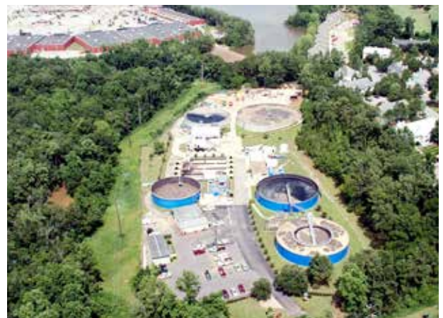
Daphne Utilities' Water Reclamation Facility had space limitations for new equipment