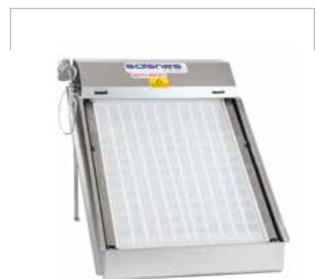
SFK200 SFK400 SFK600

Maximum Hydraulic Flow Up to 54 m 3 /h (0.3 MGD)