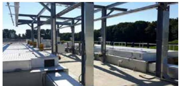
Eight SFK600 Salsnes Filters installed into channels

P.E.: 170,000 Particle Size: 0 - 100 mm Dry Weather Flow Rate: 1200 m³/h (7.6 MGD) Max. Flow Rate: 3600 m³/h (22.8 MGD) Rain weather flow TSS Removal: 50% COD Removal: 30% Dewatered Sludge: 40% Total Solids