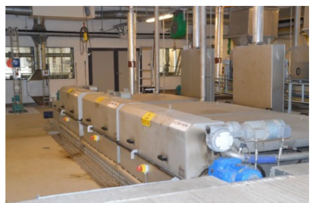
Three of the six SFK600 Salsnes Filters installed at the Plant

P.E.: 80,000 Influent TSS: 234 mg/L Effluent TSS: 95 mg/L Particle Size: 0 - 100 mm Max. Flow Rate: 589 L/s (13.4 MGD) Dewatered Sludge: 25% Total Solids